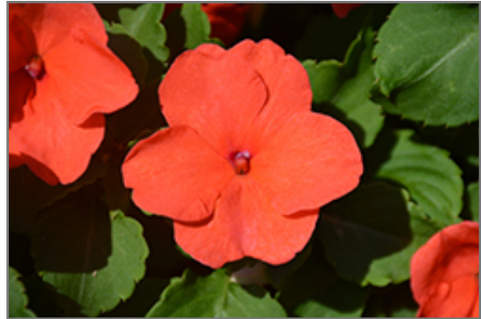
Accent Premium Salmon Impatiens flowers