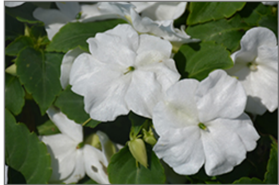
Accent Premium White Impatiens flowers