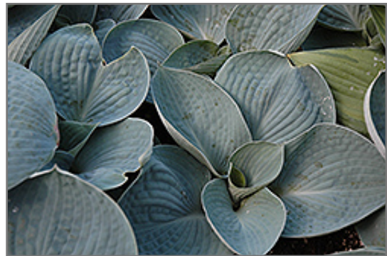
Love Pat Hosta foliage