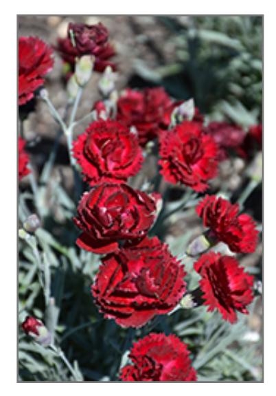
Pretty Poppers Electric Red Pinks flowers