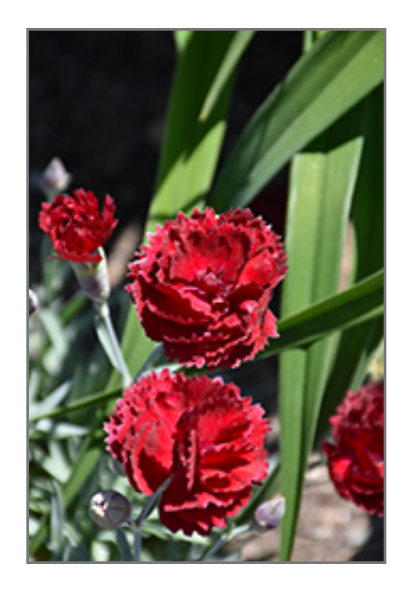
Pretty Poppers Electric Red Pinks flowers