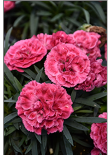
Fruit Punch Raspberry Ruffles Pinks flowers

Fruit Punch Raspberry Ruffles Pinks is recommended for the following landscape applications;