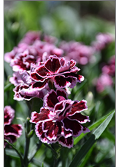
Odessa Pierrot Pinks flowers