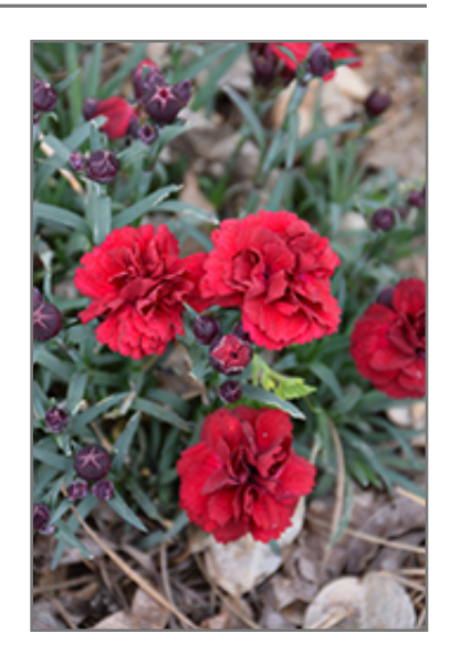
Sunflor Dynamite Carnation flowers