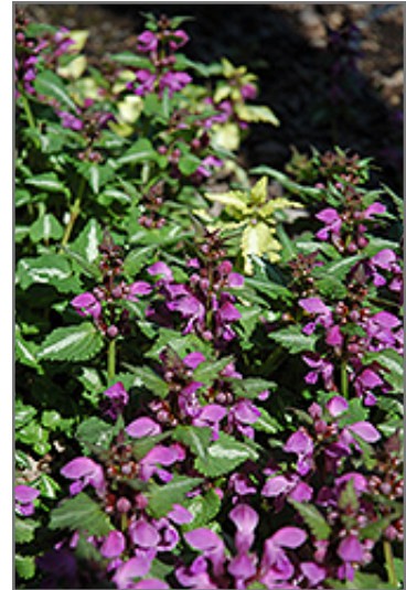
Elisabeth de Haas Spotted Dead Nettle flowers