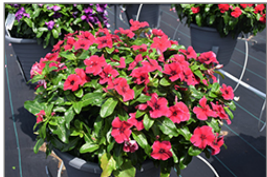
Tattoo Black Cherry Vinca in bloom