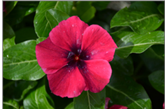
Tattoo Black Cherry Vinca flowers

Tattoo Black Cherry Vinca is recommended for the following landscape applications;