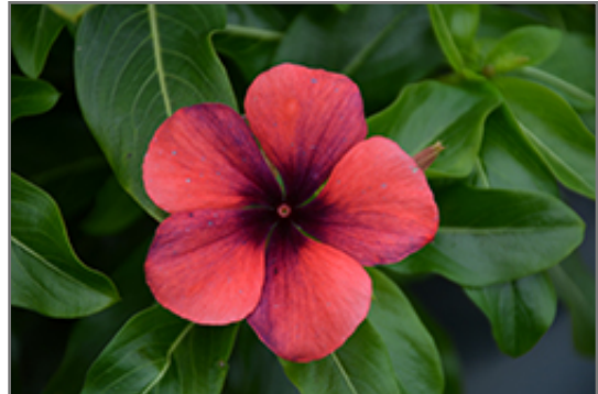
Tattoo Papaya Vinca flowers