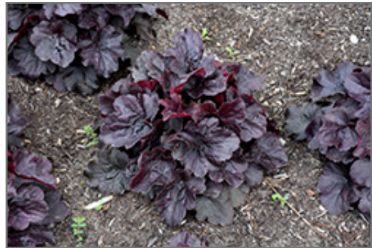
Northern Exposure Black Coral Bells