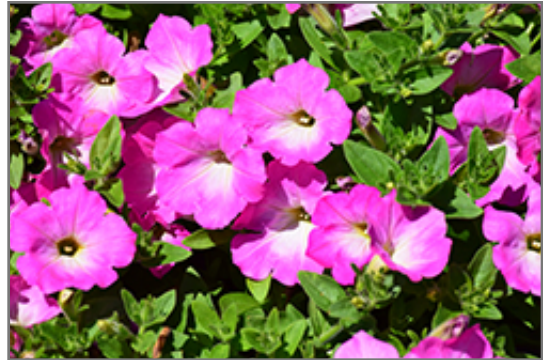
Opera Supreme Pink Morn Petunia flowers

Opera Supreme Pink Morn Petunia is recommended for the following landscape applications;