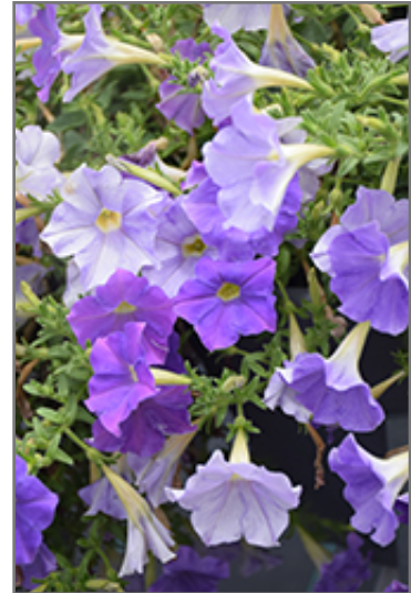
Supertunia Blue Skies Petunia flowers

Supertunia Blue Skies Petunia is recommended for the following landscape applications;