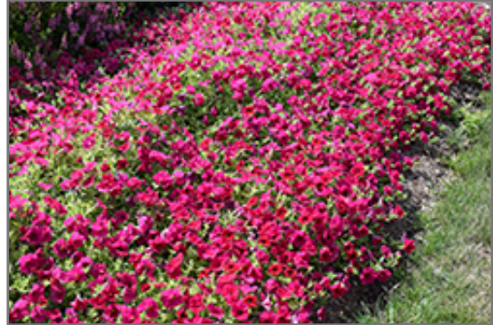
Wave Carmine Velour Petunia in bloom

Wave Carmine Velour Petunia will grow to be about 7 inches tall at maturity, with a spread of 3 feet. When grown in masses or used as a bedding plant, individual plants should be spaced approximately 24 inches apart. Its foliage tends to remain low and dense right to the ground. This fast-growing annual will normally live for one full growing season, needing replacement the following year.