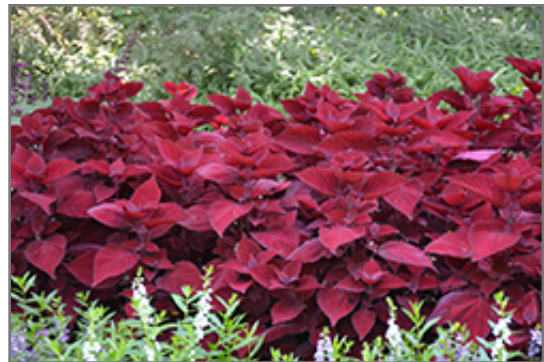
Beale Street Coleus