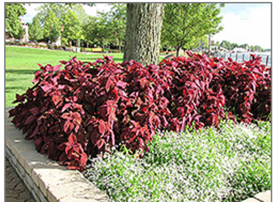
ColorBlaze Rediculous Coleus