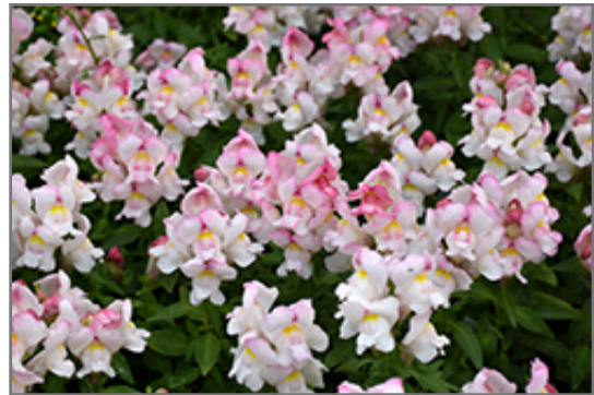
Snapshot Appleblossom Snapdragon flowers