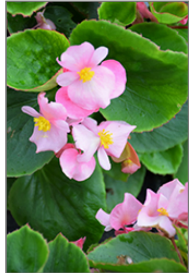
Topspin Pink Begonia flowers