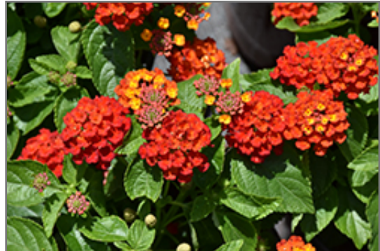
Hot Blooded Red Lantana flowers

Hot Blooded Red Lantana is recommended for the following landscape applications;