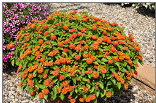
Hot Blooded Red Lantana in bloom