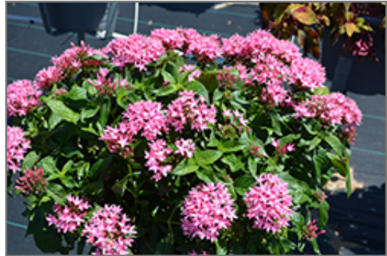
Lucky Star Deep Pink Star Flower in bloom

Lucky Star Deep Pink Star Flower will grow to be about 12 inches tall at maturity, with a spread of 14 inches. When grown in masses or used as a bedding plant, individual plants should be spaced approximately 10 inches apart. Its foliage tends to remain dense right to the ground, not requiring facer plants in front. This fast-growing annual will normally live for one full growing season, needing replacement the following year.