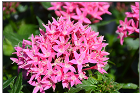
Lucky Star Deep Pink Star Flower flowers