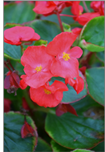
Volumia Scarlet Begonia flowers

Volumia Scarlet Begonia is recommended for the following landscape applications;