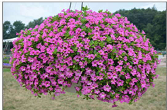
Chameleon Pink Diamond Calibrachoa in bloom