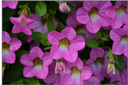
Chameleon Pink Diamond Calibrachoa flowers

Chameleon Pink Diamond Calibrachoa is recommended for the following landscape applications;