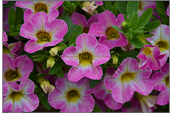
Chameleon Starlet Pink Calibrachoa flowers

Chameleon Starlet Pink Calibrachoa is recommended for the following landscape applications;