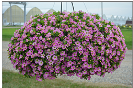
Chameleon Starlet Pink Calibrachoa in bloom