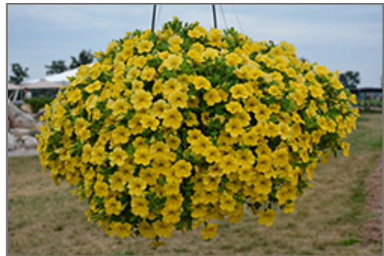
Lia Yellow Calibrachoa in bloom