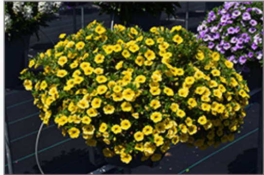
Lia Yellow Calibrachoa in bloom

Lia Yellow Calibrachoa will grow to be about 10 inches tall at maturity, with a spread of 18 inches. When grown in masses or used as a bedding plant, individual plants should be spaced approximately 12 inches apart. Its foliage tends to remain low and dense right to the ground. This fast-growing annual will normally live for one full growing season, needing replacement the following year.