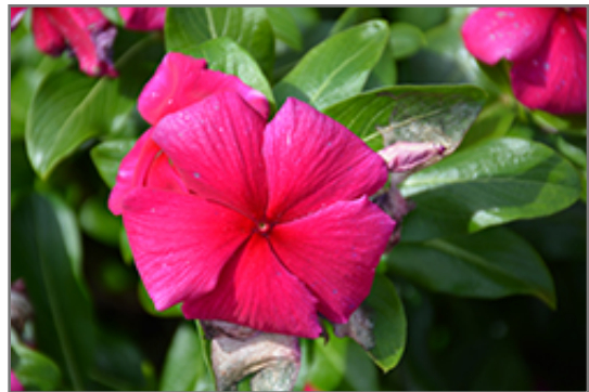
Cora XDR Hotgenta flowers