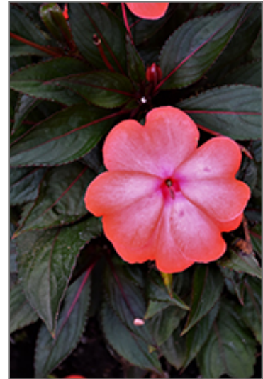
Magnum Wild Salmon New Guinea Impatiens flowers

Magnum Wild Salmon New Guinea Impatiens is recommended for the following landscape applications;