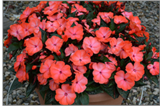
Magnum Wild Salmon New Guinea Impatiens in bloom

Magnum Wild Salmon New Guinea Impatiens will grow to be about 8 inches tall at maturity, with a spread of 14 inches. When grown in masses or used as a bedding plant, individual plants should be spaced approximately 12 inches apart. Its foliage tends to remain low and dense right to the ground. This fast-growing annual will normally live for one full growing season, needing replacement the following year.