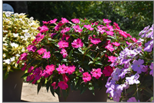
SunPatiens Vigorous Rose Pink New Guinea Impatiens in bloom

SunPatiens Vigorous Rose Pink New Guinea Impatiens will grow to be about 3 feet tall at maturity, with a spread of 3 feet. When grown in masses or used as a bedding plant, individual plants should be spaced approximately 32 inches apart. Its foliage tends to remain dense right to the ground, not requiring facer plants in front. This fast-growing annual will normally live for one full growing season, needing replacement the following year.