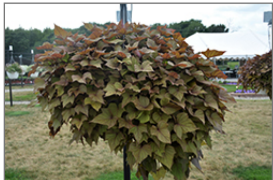
Sidekick Heart Bronze Sweet Potato Vine