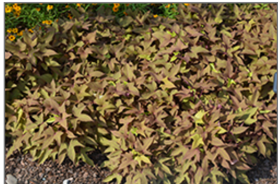
Sidekick Heart Bronze Sweet Potato Vine