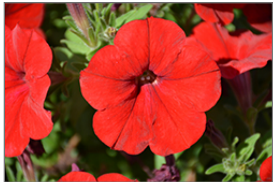
Capella Ruby Red Petunia flowers