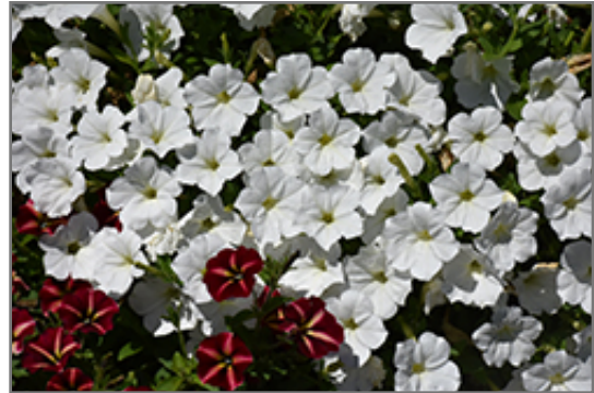
ColorRush White Petunia flowers

ColorRush White Petunia is recommended for the following landscape applications;