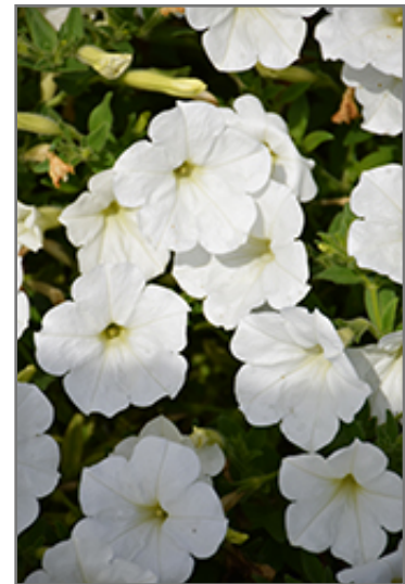
ColorRush White Petunia flowers