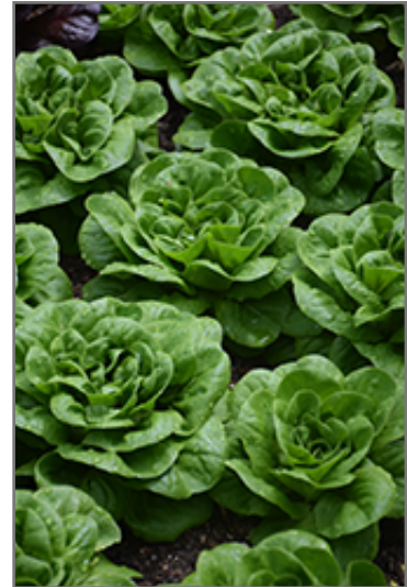
Buttercrunch Lettuce

Buttercrunch Lettuce will grow to be about 12 inches tall at maturity, with a spread of 6 inches. When planted in rows, individual plants should be spaced approximately 8 inches apart. This vegetable plant is an annual, which means that it will grow for one season in your garden and then die after producing a crop. Because of its relatively short time to maturity, it lends itself to a series of successive plantings each staggered by a week or two; this will prolong the effective harvest period.