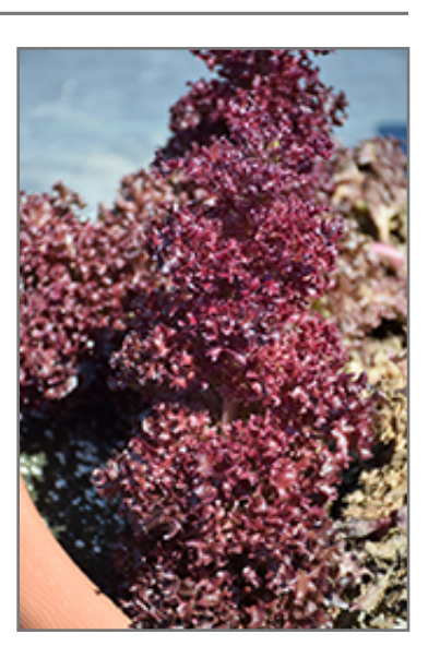
Salanova Red Incised Lettuce foliage

Salanova Red Incised Lettuce is a good choice for the vegetable garden, but it is also well-suited for use in outdoor pots and containers. It is often used as a 'filler' in the 'spiller-thriller-filler' container combination, providing the canvas against which the thriller plants stand out. Note that when growing plants in outdoor containers and baskets, they may require more frequent waterings than they would in the yard or garden.