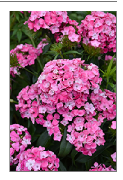
Dash Magician Sweet William flowers