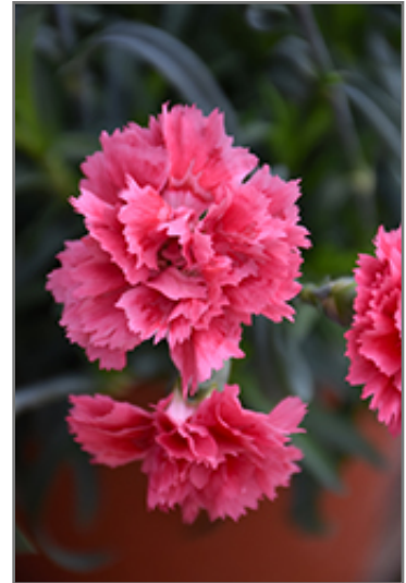
Oscar Salmon Carnation flowers

Oscar Salmon Carnation will grow to be about 8 inches tall at maturity, with a spread of 8 inches. When grown in masses or used as a bedding plant, individual plants should be spaced approximately 6 inches apart. Its foliage tends to remain low and dense right to the ground. It grows at a medium rate, and under ideal conditions can be expected to live for approximately 5 years. As an evergreen perennial, this plant will typically keep its form and foliage year-round.