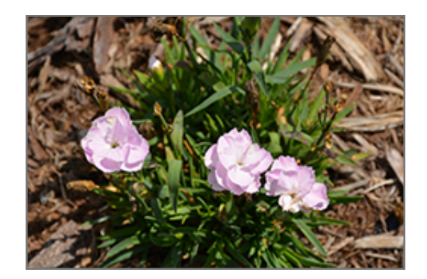
Constant Beauty Pink Pinks flowers