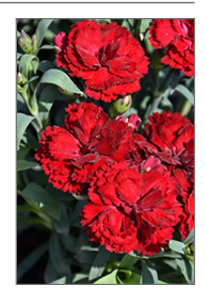
Constant Beauty Red Pinks flowers