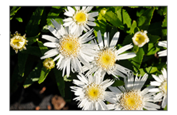
Lancaster Double Angel Shasta Daisy flowers