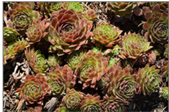
Rocknoll Rosette Hens And Chicks