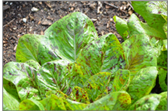
Freckles Romaine Lettuce foliage

Freckles Romaine Lettuce will grow to be about 10 inches tall at maturity, with a spread of 9 inches. When planted in rows, individual plants should be spaced approximately 6 inches apart. This vegetable plant is an annual, which means that it will grow for one season in your garden and then die after producing a crop. Because of its relatively short time to maturity, it lends itself to a series of successive plantings each staggered by a week or two; this will prolong the effective harvest period.