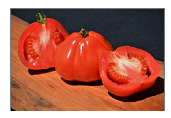
Periforme Abruzzese Tomato fruit and flesh