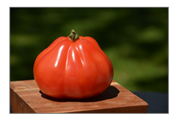
Periforme Abruzzese Tomato fruit