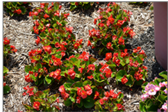
Sprint Plus Red Begonia in bloom