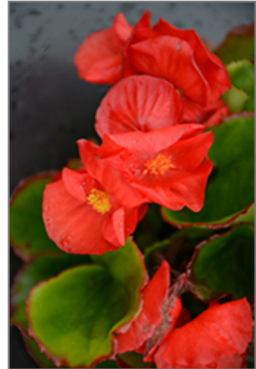
Sprint Plus Red Begonia flowers

Sprint Plus Red Begonia is recommended for the following landscape applications;