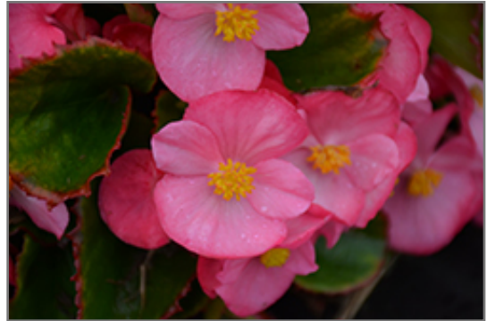
Sprint Plus Rose Begonia flowers

Sprint Plus Rose Begonia is recommended for the following landscape applications;