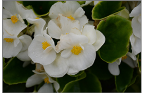
Sprint Plus White Begonia flowers

Sprint Plus White Begonia is recommended for the following landscape applications;