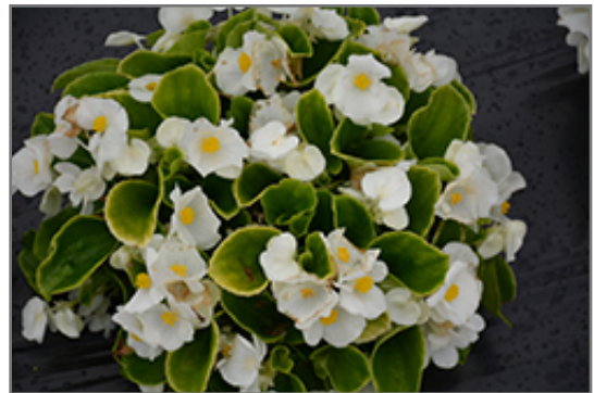
Sprint Plus White Begonia in bloom