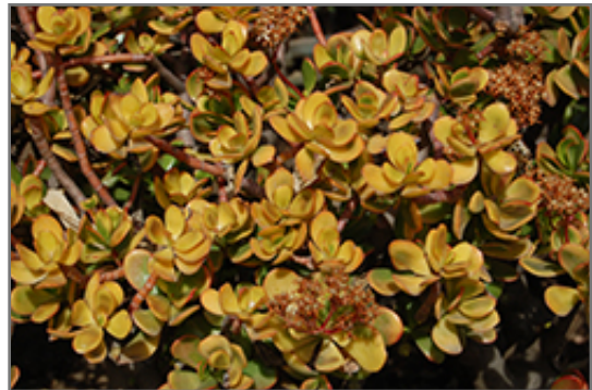
Hummel's Sunset Golden Jade Plant foliage