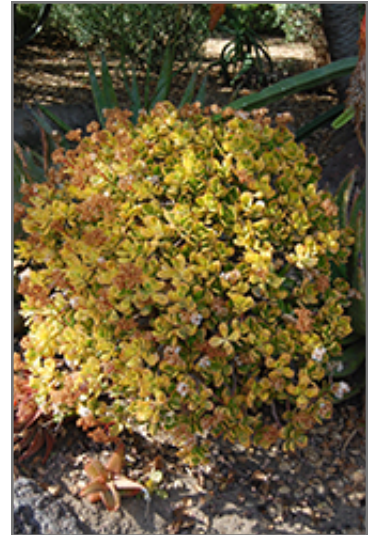
Hummel's Sunset Golden Jade Plant in bloom

Hummel's Sunset Golden Jade Plant is recommended for the following landscape applications;