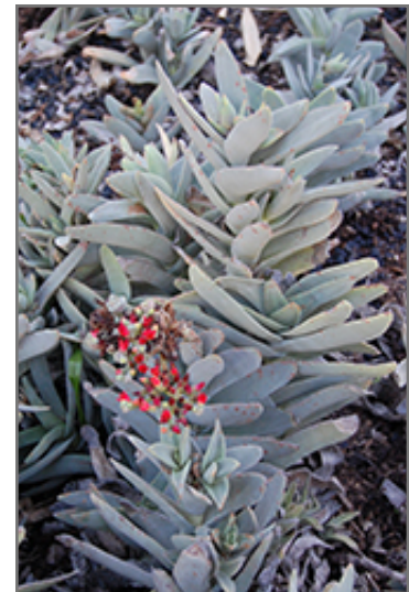
Airplane Plant in bloom