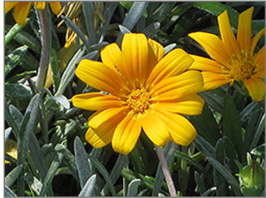
Orange Trailing Gazania flowers