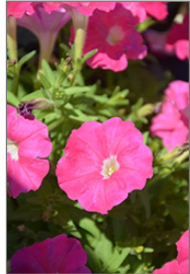
Picobella Pink Petunia flowers