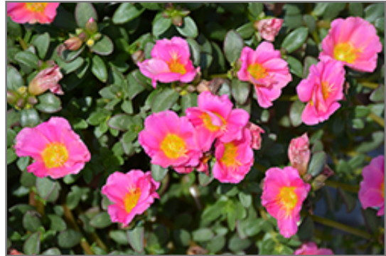
Pazzaz Sweet Pink Portulaca flowers

Pazzaz Sweet Pink Portulaca is recommended for the following landscape applications;