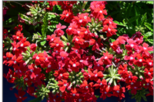
Obsession Cascade Red with Eye flowers

Obsession Cascade Red with Eye is recommended for the following landscape applications;