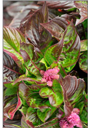
Sol Gekko Green Celosia flowers