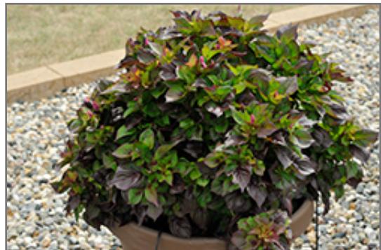
Sol Gekko Green Celosia